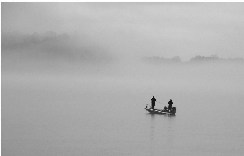
Monochrome Digital 2nd place by Ernie High