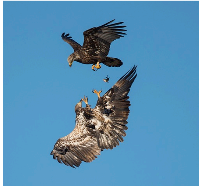
Color Digital