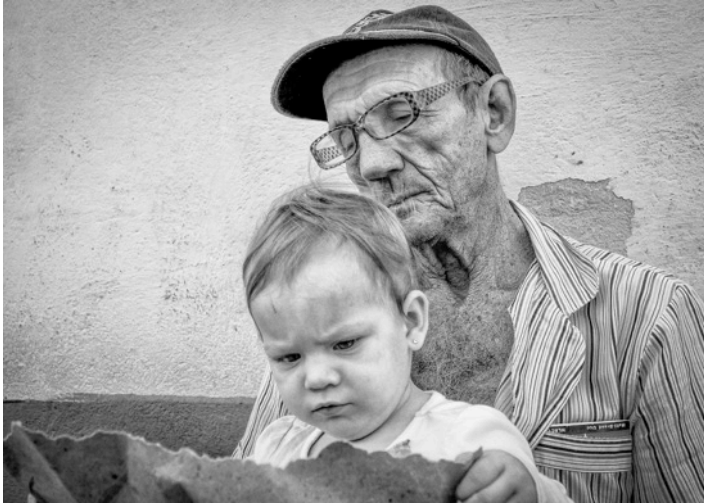
Monochrome Digital by Gayle Biggs