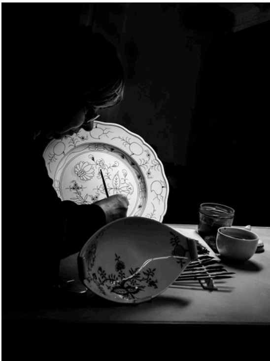
Monochrome Print by Charles Leverett