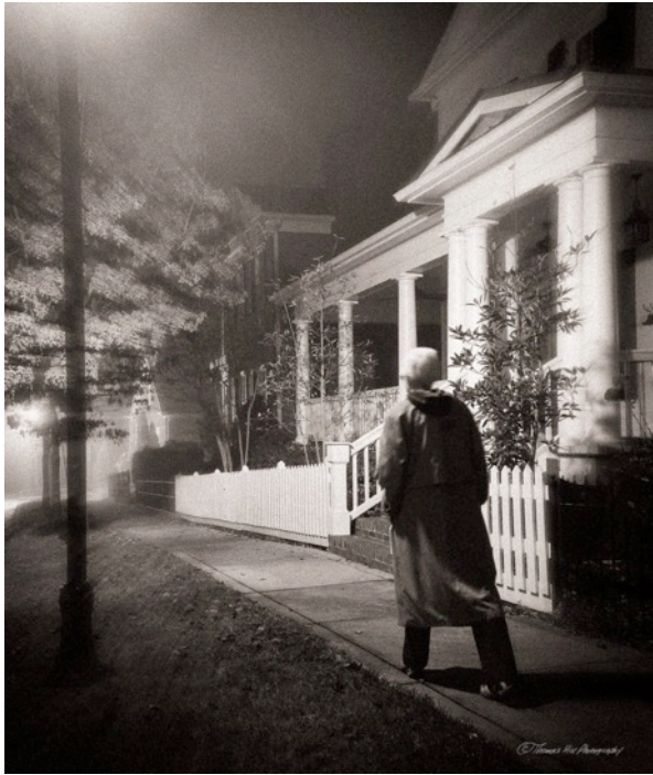
Monochrome Print by Tom Hix