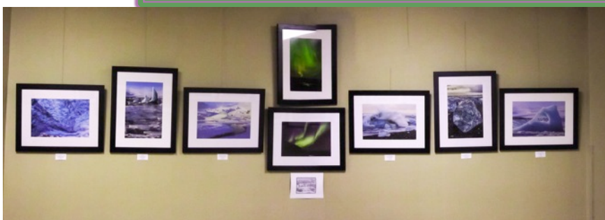
Barb Staggs' display