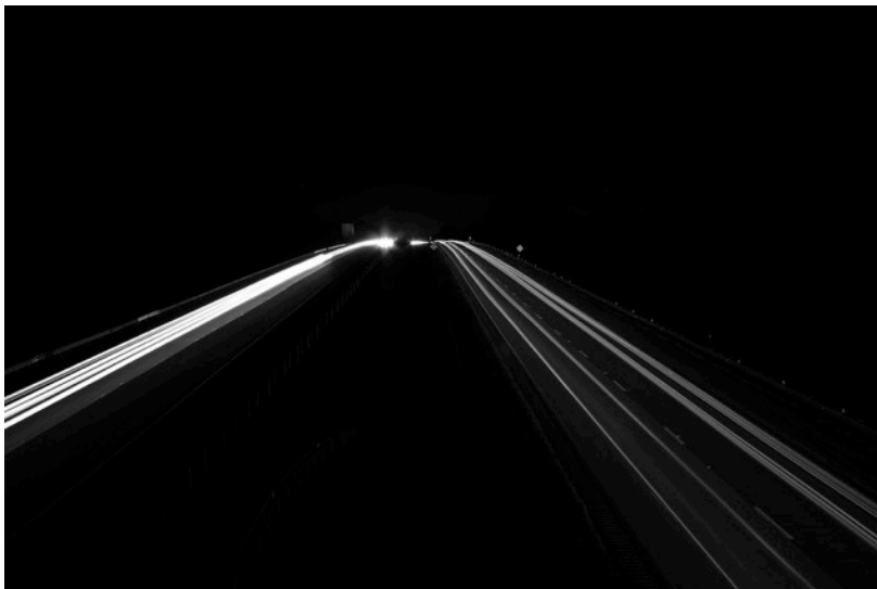
Monochrome Digital by James Burton II