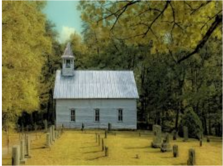
Color Digital by David Little