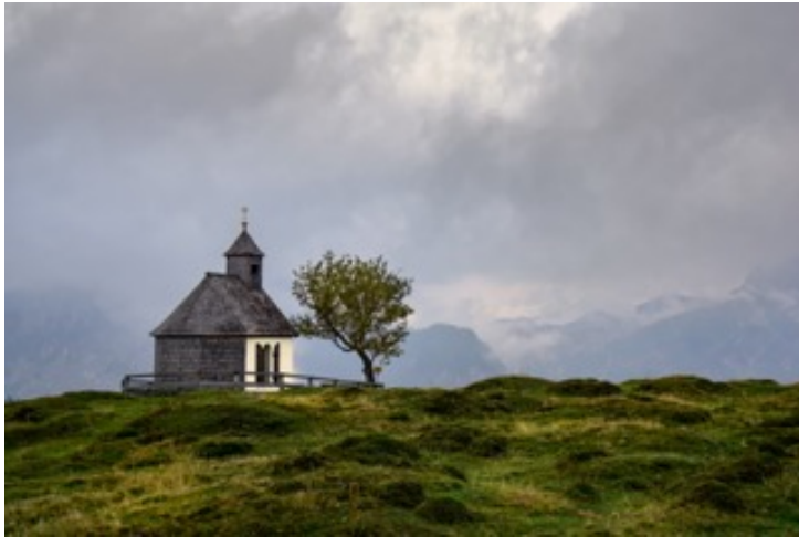
Color Print by Charles Leverett