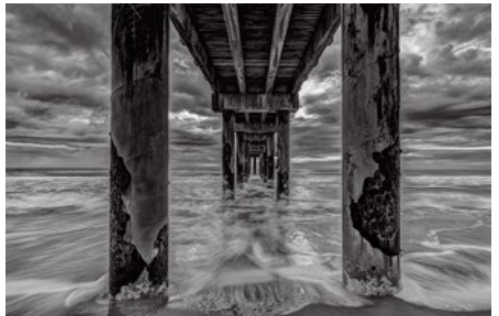
Monochrome Digital by Charles Gattis