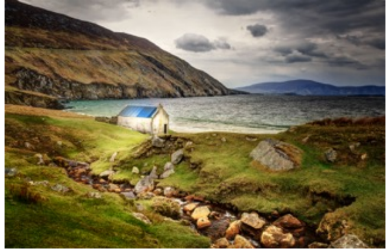
Color Digital by Charles Gattis