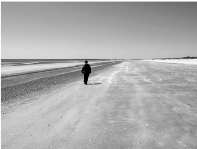
Monochrome Print by Charles Leverett