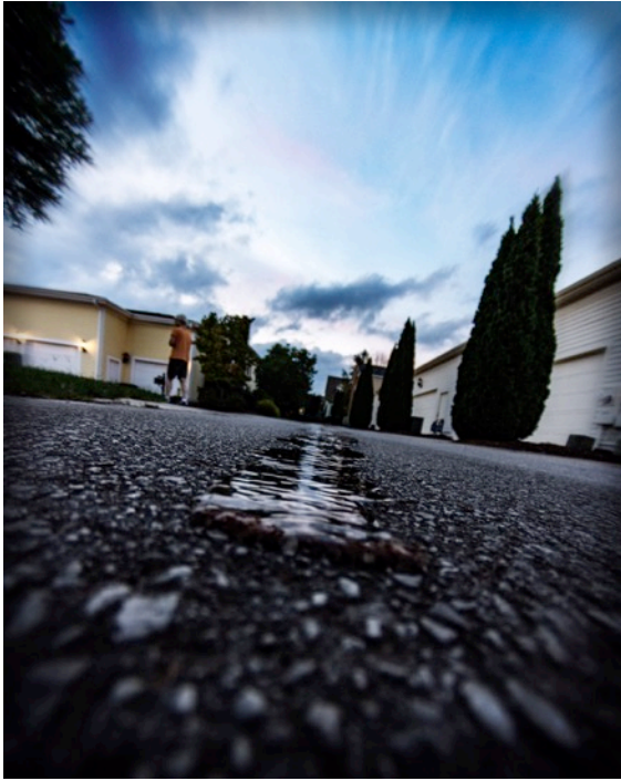
Color Print by Tom Hix