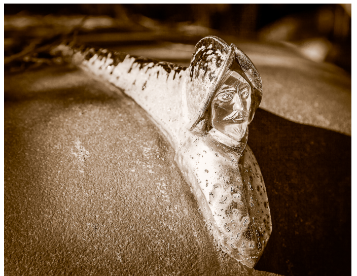
Monochrome Print by Eddie Sewall