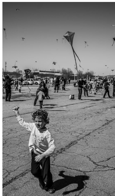
Monochrome Digital 3 rd place by Cliff Loehr