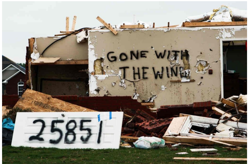
Color Digital 2 nd Place by Dorinda Tyler