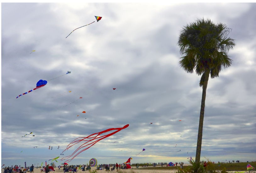
Color Digital 3rd Place by Barb Montgomery