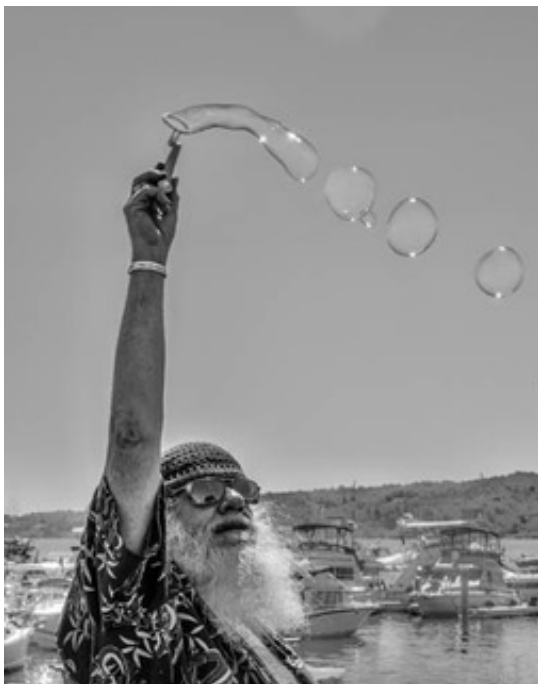
Monochrome Print 1 st place by Charles Leverett