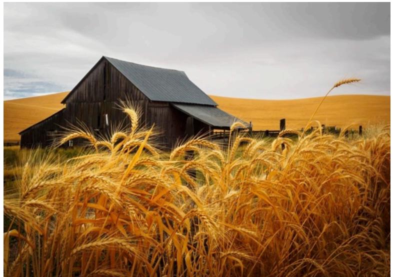
Color Digital 1st Place by Gayle Biggs