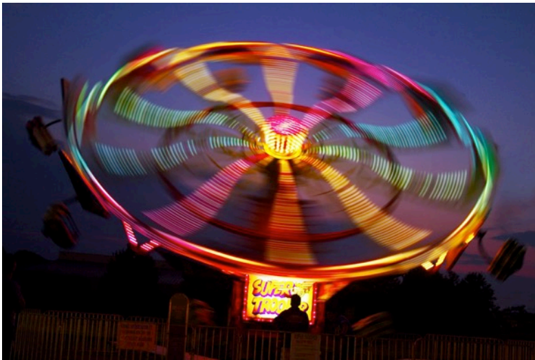
Color Digital 1st Place by Barb Montgomery