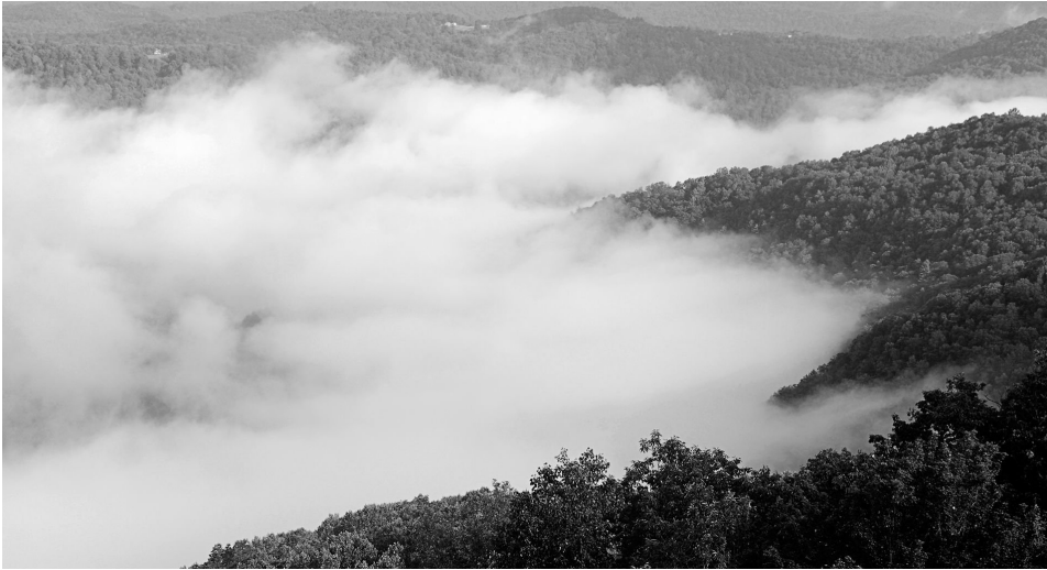
Monochrome Digital 3rd place by Carol Blue