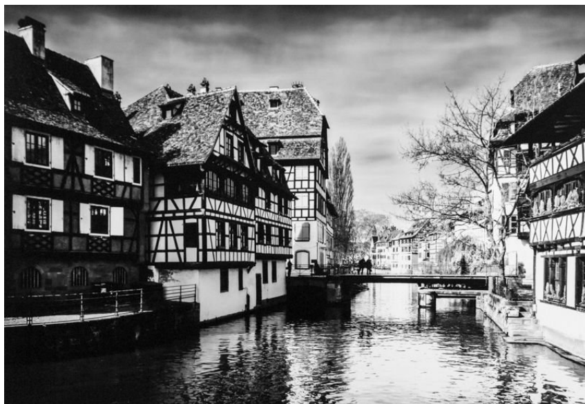
Monochrome Print 2 nd place by Charles Gattis