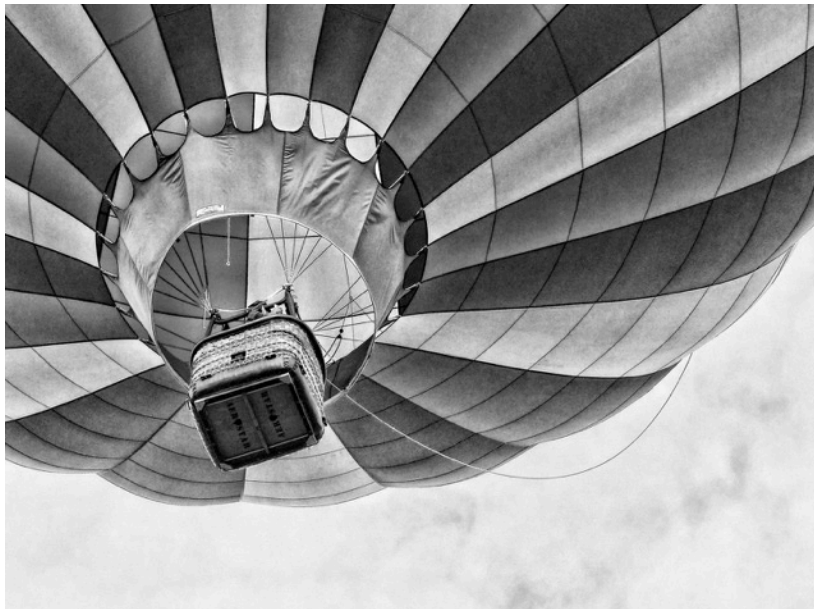
Monochrome Digital 3rd place by Liz High