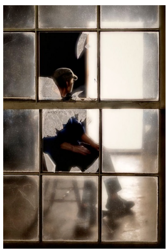
Color Digital 2<sup>nd</sup> Place by Ron Atchley