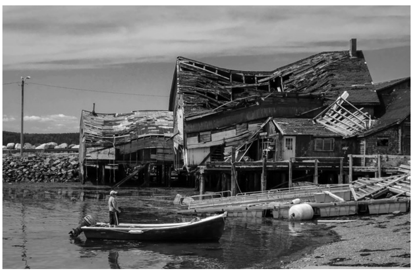
Monochrome Print 2<sup>nd</sup> place by Doris Leverett