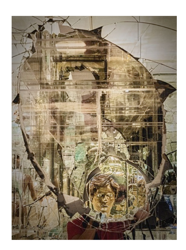
Color Digital 3rd place by Barb Staggs