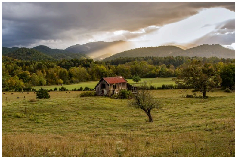
Color Digital 2 nd Place by Gail Patton