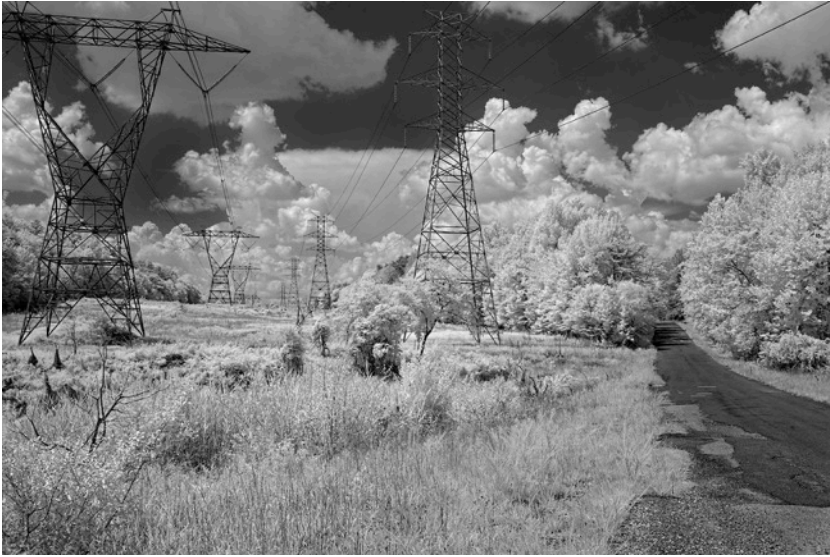
Monochrome Digital 3rd place by Ernie High