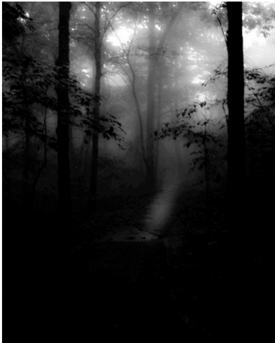
Monochrome Digital 2nd place by Bess Wills