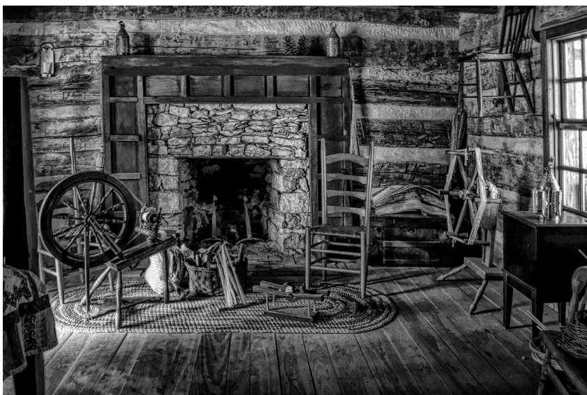
Monochrome Digital 2nd place by Barb Montgomery