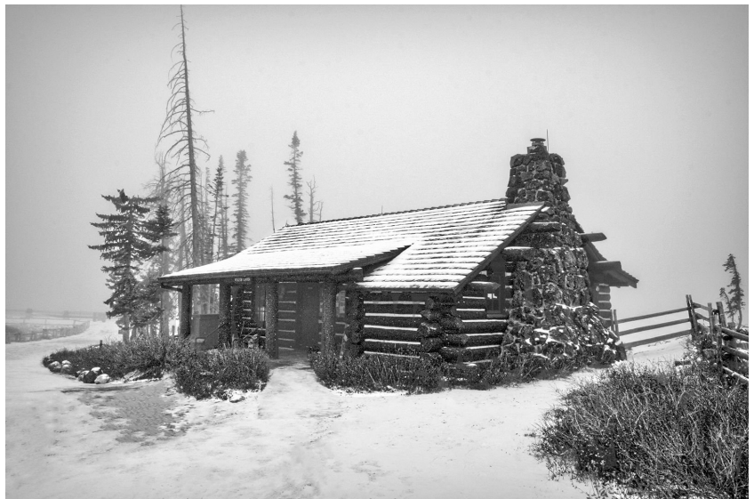
Monochrome Digital 1 st place by Barb Montgomery