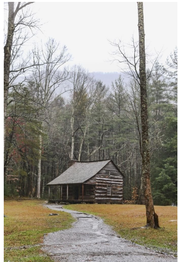
Color Digital 2 nd Place by Susi Stroud