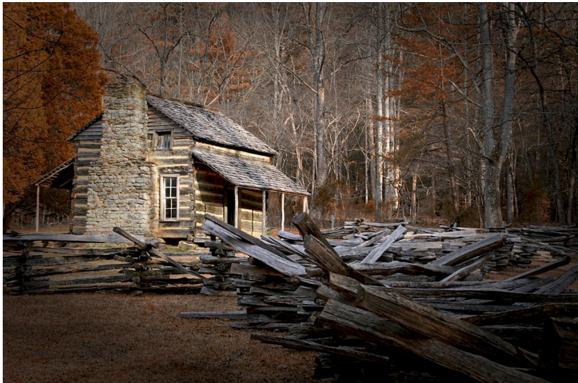
Color Print 1 st place by Barb Staggs