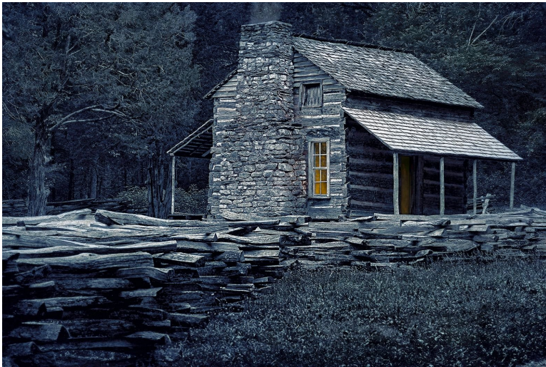
Color Digital 1st Place