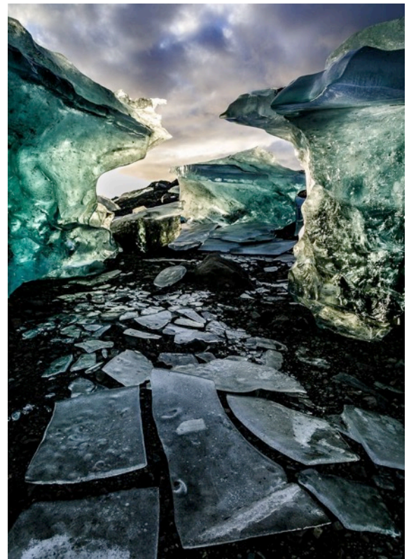
Color Digital 2 nd Place by Earl Todd