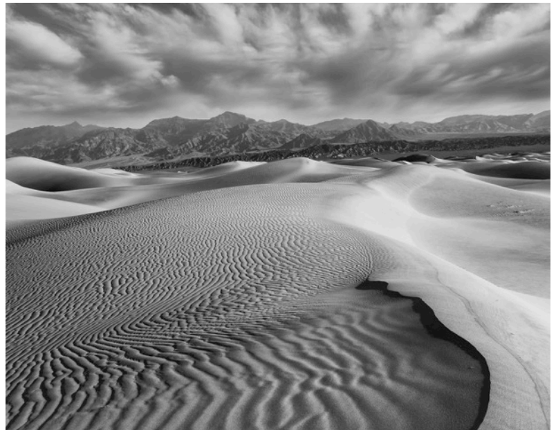
Monochrome Print 1 st place by Tom Bryant