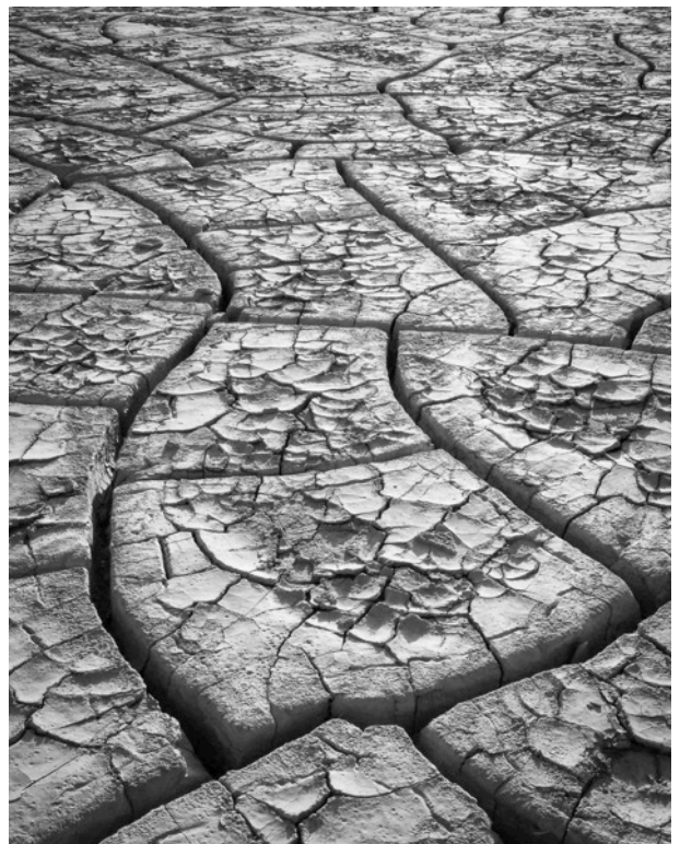
Monochrome Print 3 rd place by Emily Saile