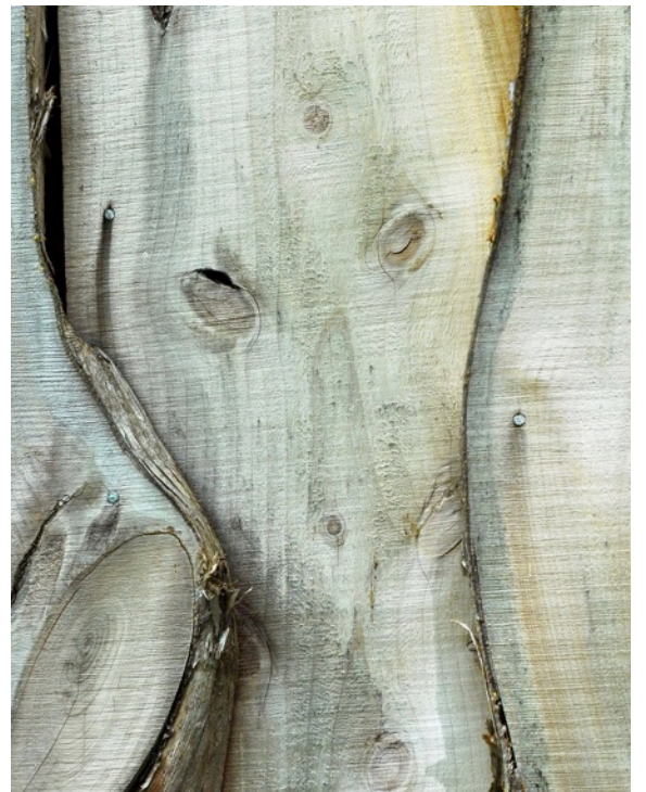
Color Print 2 nd place by Alan Forney