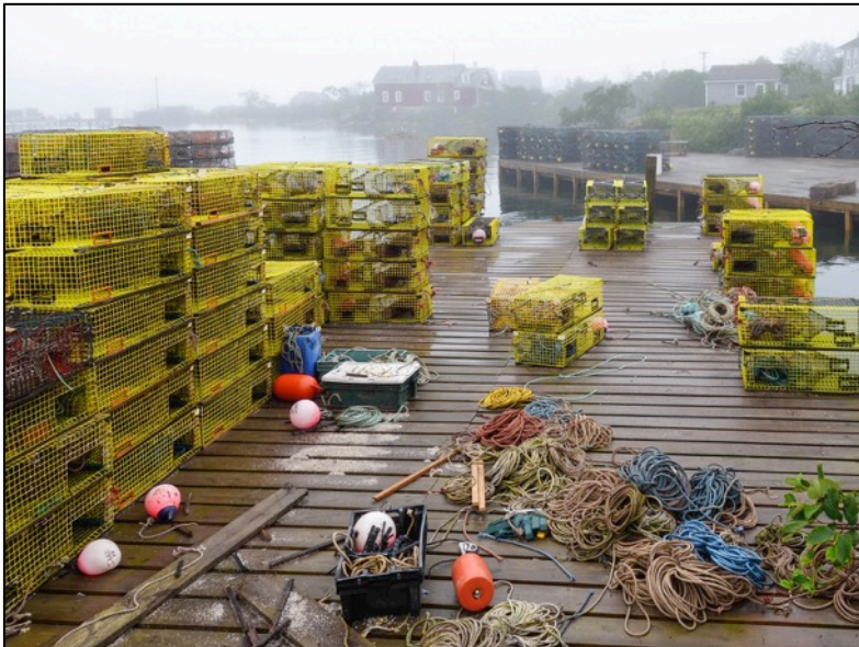
Color Print 1 st place by Charles Leverett