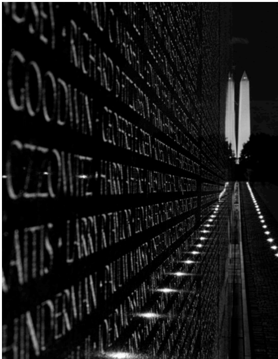
Monochrome Digital 2nd place by Earl Todd