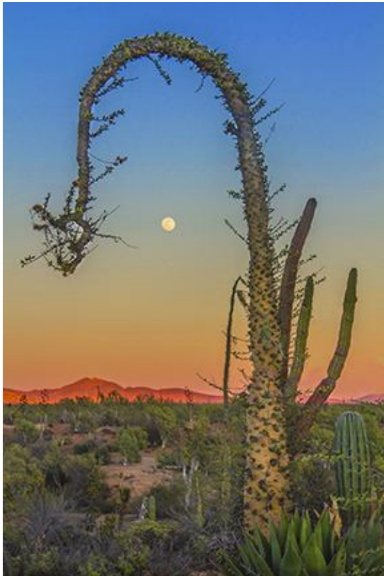
Color Print 3rd place by Barb Staggs