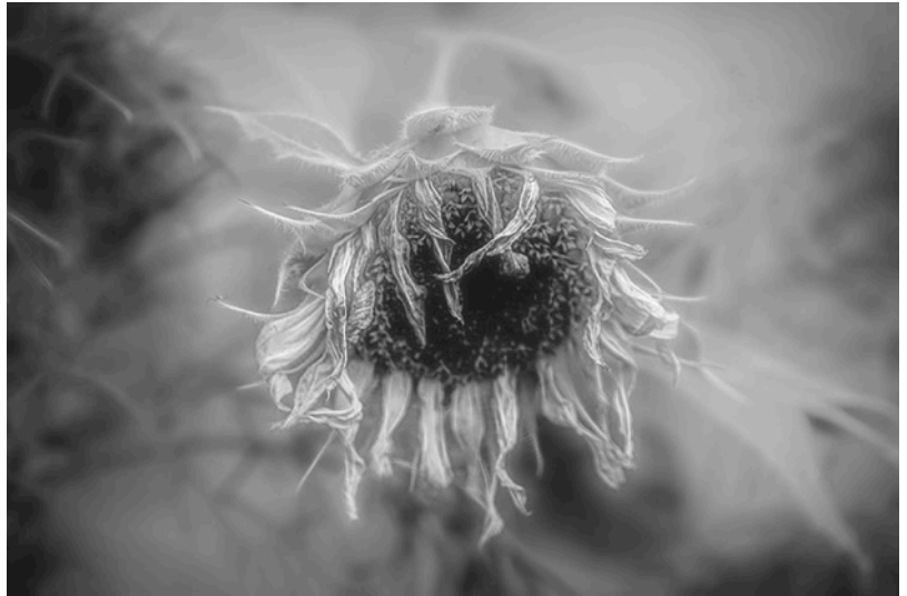
Monochrome Digital 1 st place by Barb Montgomery