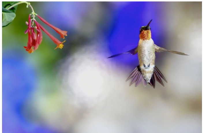
Color Digital 2 nd Place by Don Bennett