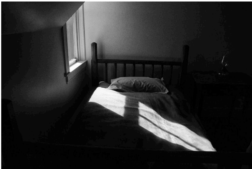
Monochrome Digital 2 nd place by Sam Tumminello