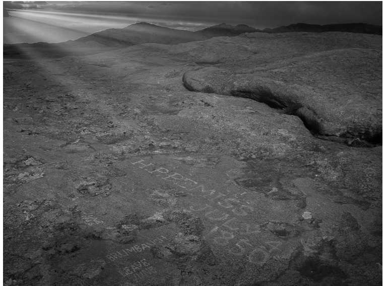
Monochrome Digital 1st