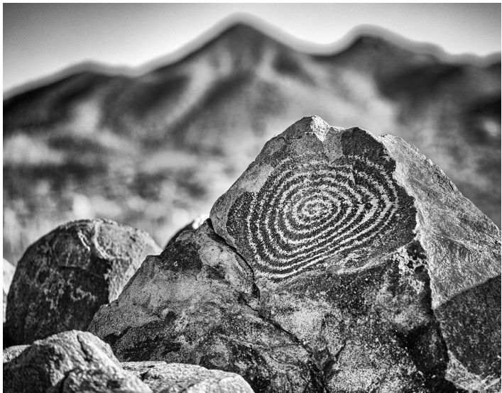
Monochrome Print 2nd place by Earl Todd