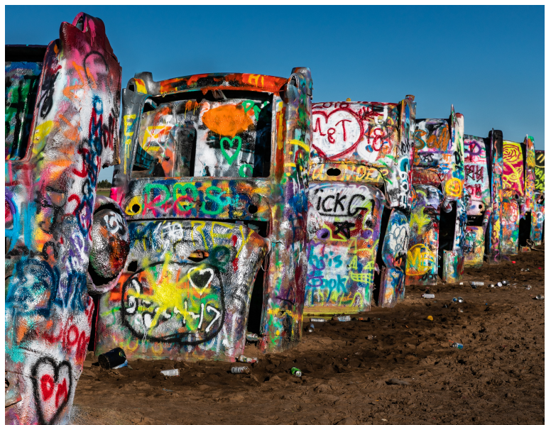
Color Print 2nd place by Earl Todd