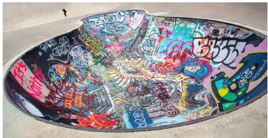
Color Digital 2 nd Place by Susi Stroud