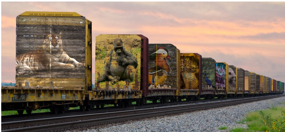
Color Digital 1 st place by Larry Sanders