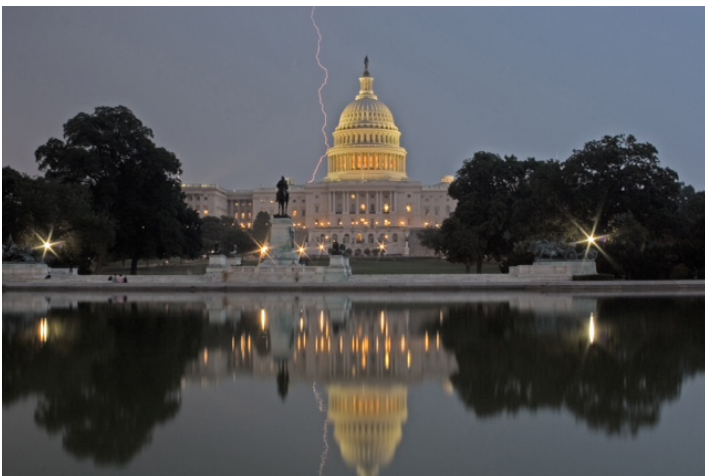
Digital Third Place - Tim Solomon