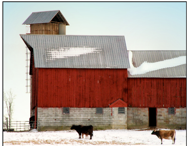
Digital Second Place - Barb Montgomery