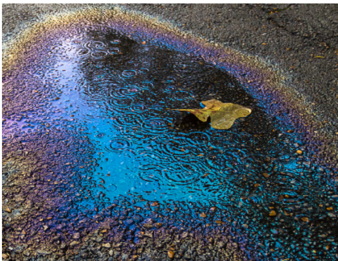
Color Print Second Place - Tom Bryant