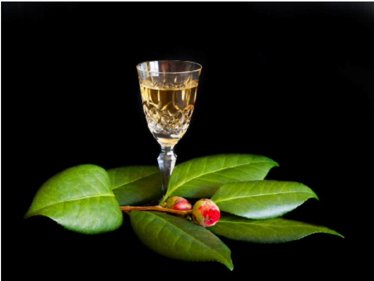
Digital BOY - Eddie Sewall