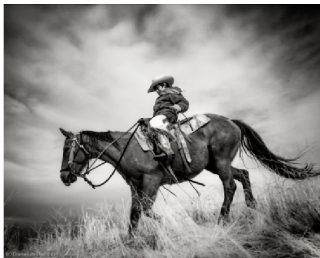
Monochrome Print Second Place - Diana Davidson