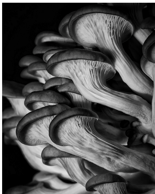
Monochrome Print Third Place - Dave Edens