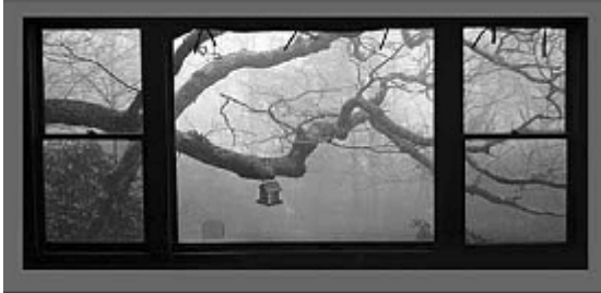
© Tom Bryant - Black & White Print