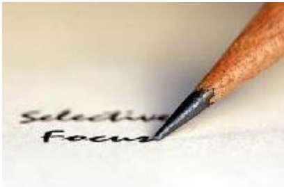
© Jerry Green - Color Print