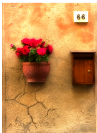
See Cover Story, How To Create Surrealist Scenes.