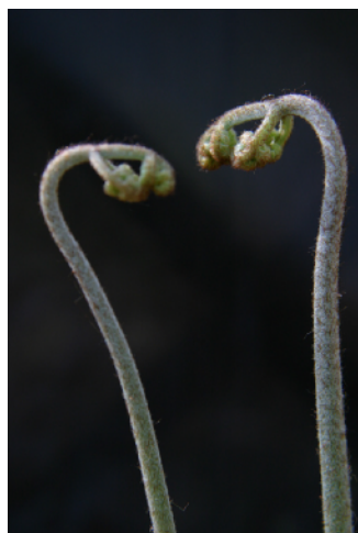
See July program, p. 1.