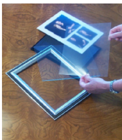
New Picture Shields insert

This is a brand new product suitable for any glass framed object. They are a 7 mil tri-laminate that comes in precut 8X10 or 5X7 sheets. The product can be custom cut up to 20 inches or customized yourself by simply using scissors. They block 99% of the UV, are scratch resistant, and are half again the cost of Plexiglas or Light Impression's Acrylite. They also have a matt finish for glare control. One other nice feature of the product is that you can place the insert on the inside of the glass to protect the framed object if the glass should break, or you can place it between the frame and glass to help retain the shattered glass if broken and "childproof" the frame. By far this is the most protection for the best value in the vast majority of cases. It's been long overdue and worth trying. Unlike the green tint of the conservation glass, the UV coating has a yellow tint. As with the conservation glass the yellow tint seems to visually fade away when placed into the frame against the glass. The inserts and custom cuts can be purchased at the company website pictureshields.com .