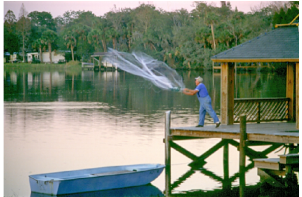
First Place Slide by Emily Saile