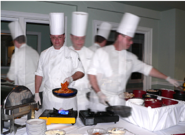
First Place Color Print by Emily Saile