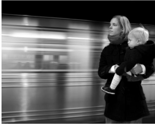
First Place B&W Print by Barb Hitt