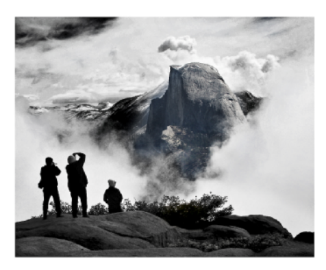
First Place B&W Print by Don Wolfe