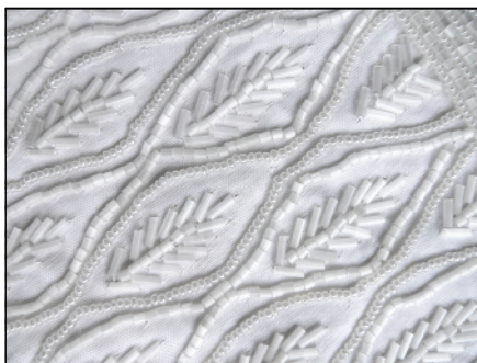
Slide by Emily Saile