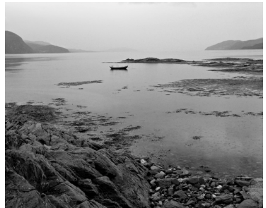
Black & White Print by Ernie High