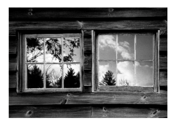
B&W Print by Carol Blue