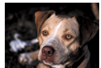
Third Place -Emily Saile