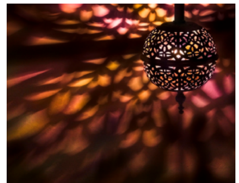
Color Print by Barb Montgomery