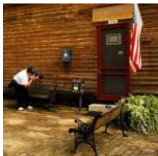
Mooresville Post Office. See photowalk story on page 1.