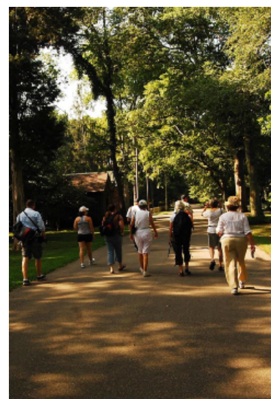
Photowalk participants walking through historic Mooresville