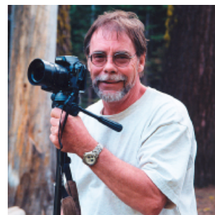
Photo Tour of Tennessee Aquarium