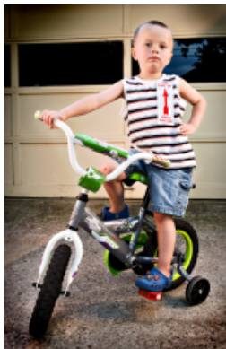
(Digital, Monochrome, and Slide not available)