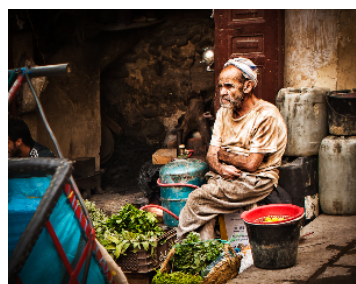
See winning images, p. 4.