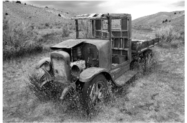
Monochrome Print by Walt Schumacher