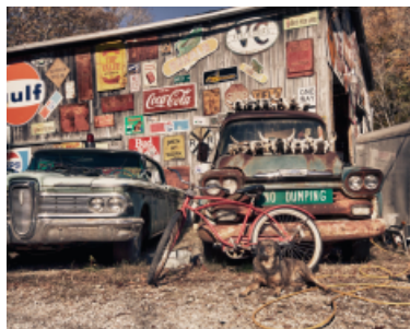
HDR final image, after combining 3 files. See story p. 1.