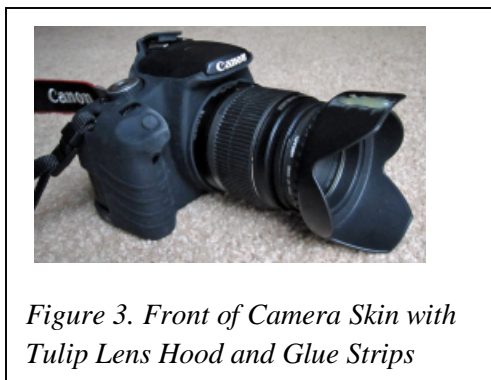
Figure 3. Front of Camera Skin with Tulip Lens Hood and Glue Strips