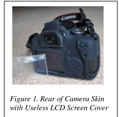
Figure 1. Rear of Camera Skin with Useless LCD Screen Cover

UV Filter -- Digital cameras don't need a UV filter (built into the sensor) but my kit lens is all plastic including the threads on the filter attachment. Extra glass surfaces degrade an image so there is a trade-off for using one, but they provide a lot of protection for the lens and for the filter threads. My lens hood with plastic threads won't stay in place on the bare plastic lens threads, but will stay on the metal UV filter threads. The UV filter protects both the glass and filter attachment.