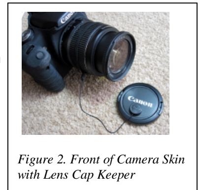
Figure 2. Front of Camera Skin with Lens Cap Keeper

Lens Cap Keeper -- This costs about $2.75 at Southerland's Photo and is well worth it. I'm bad about laying mine down and leaving it. Having the lens cap in place protects the glass and the filter threads (Figure 2).