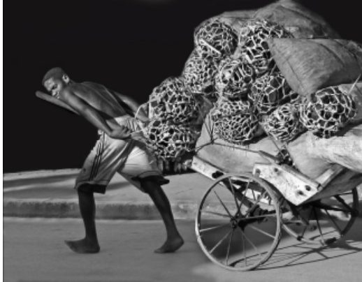
Monochrome Print by Barb Hitt