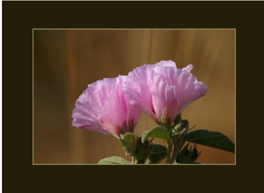
Digital by Stan Prevost