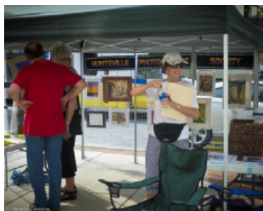
HPS Booth at Huntsville Art-Stroll. See additional picture on p. 6.