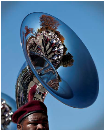
Color Print by Ernie High