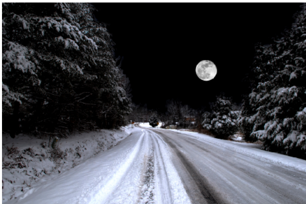
Color Print by Walt Tyszka