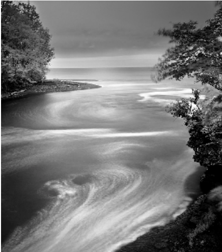
Monochrome Print by Stan Prevost