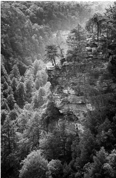
Monochrome Print by Ernie High