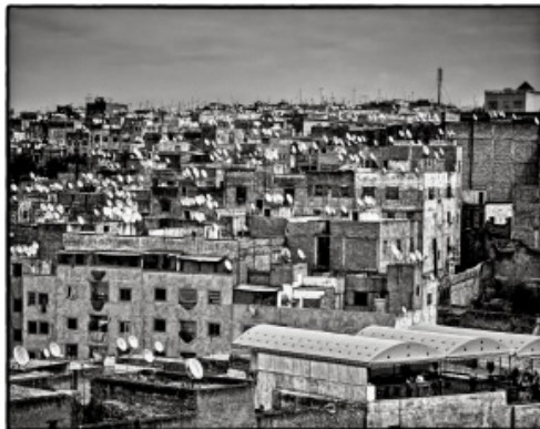
Monochrome Second Place - Diana Davidson