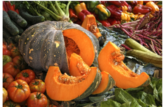
Digital by Barb Staggs