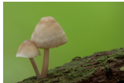
Tim Solomon, 2nd Place, Wildflower category