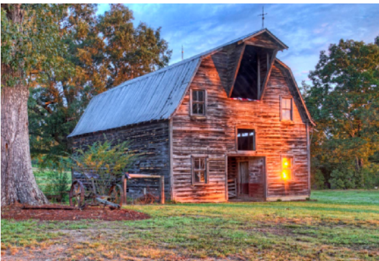
Color Print