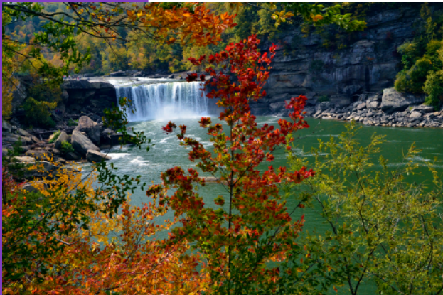
Cumberland Falls