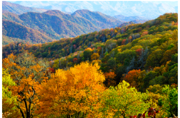
North Carolina Smokies by Carol Blue