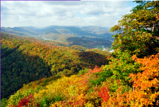
Cumberland Gap by Carol Blue

Carol and David Blue took a Fall Color excursion through the southeastern mountains. The trip began at Cumberland Falls SRP in KY, continued through the Cumberland Gap and into the Smokies. The fall color was fabulous.