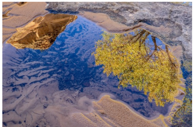
Color Digital 2 nd place by Barb Staggs