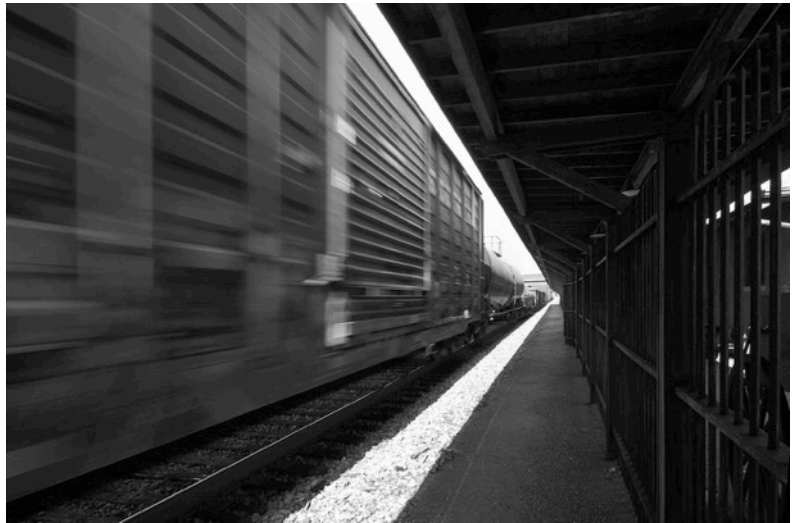
Monochrome Digital 3rd place by Alan Montgomery