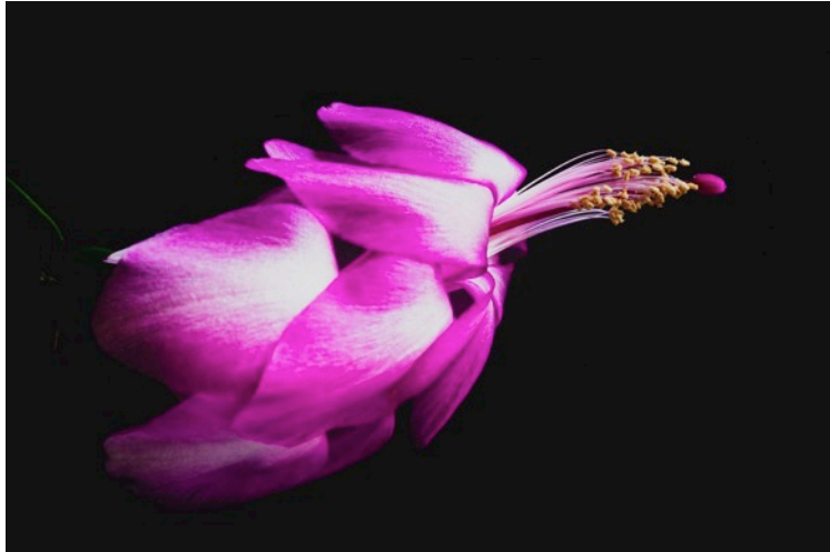
Color Digital 3rd place by Jim Spinoso