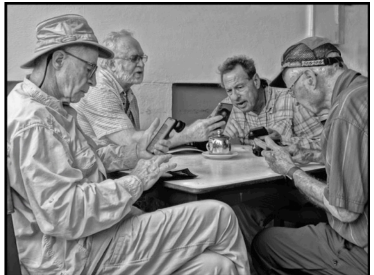
Monochrome Print 2nd place by Charles Leverett