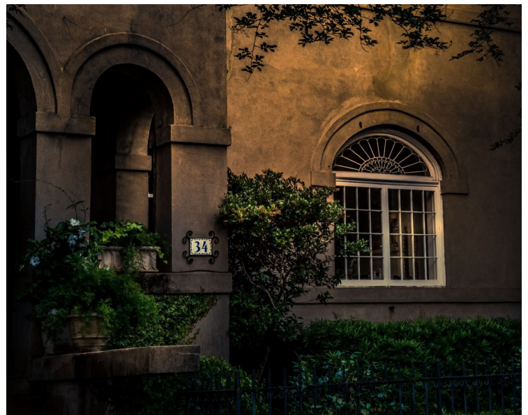
Color Digital 2 nd place