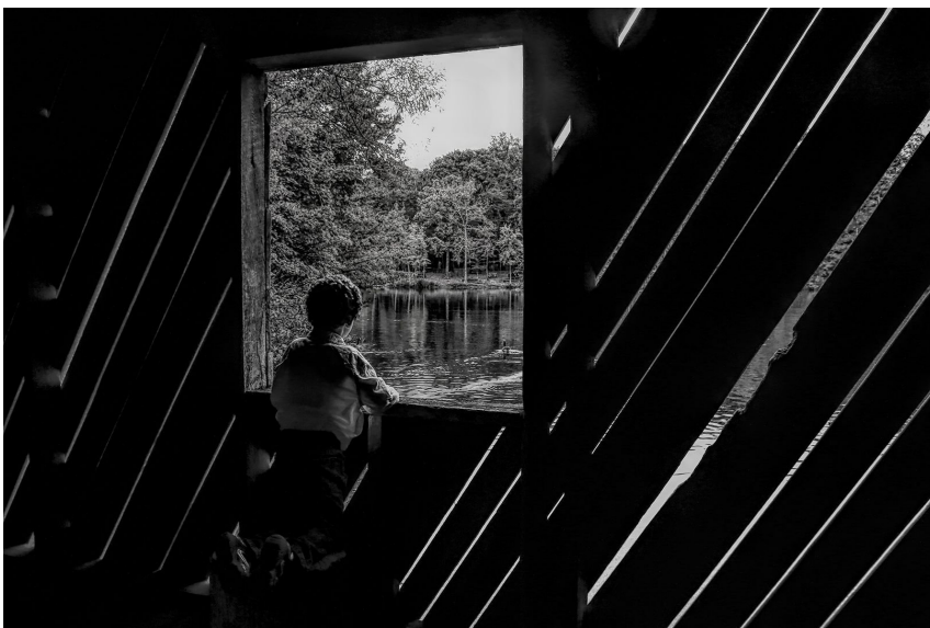
Monochrome Digital 2nd place by Barb Montgomery