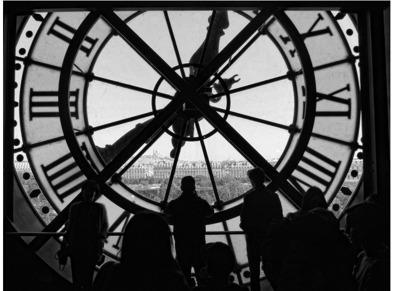
Monochrome Digital 3rd place by Liz High