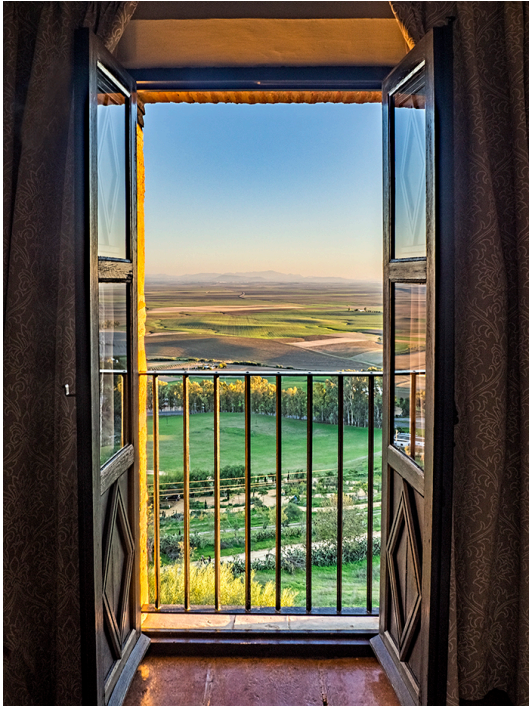
Color Print 3rd place by Barb Staggs