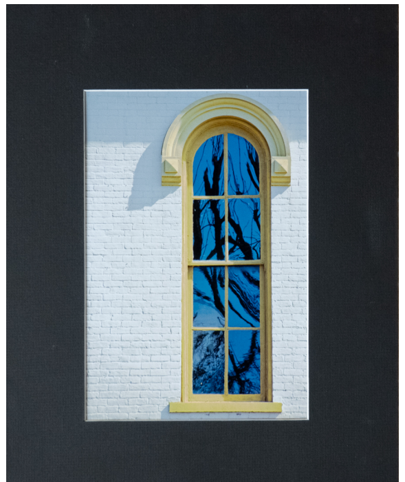
Color Print 2 nd place by Barb Staggs