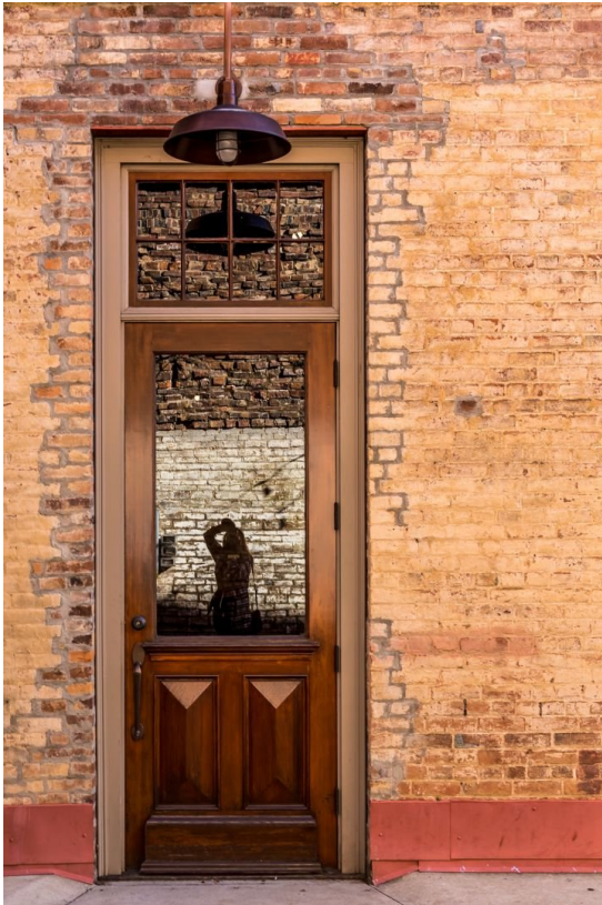
Color Digital 1 st place by Blanca Eyre