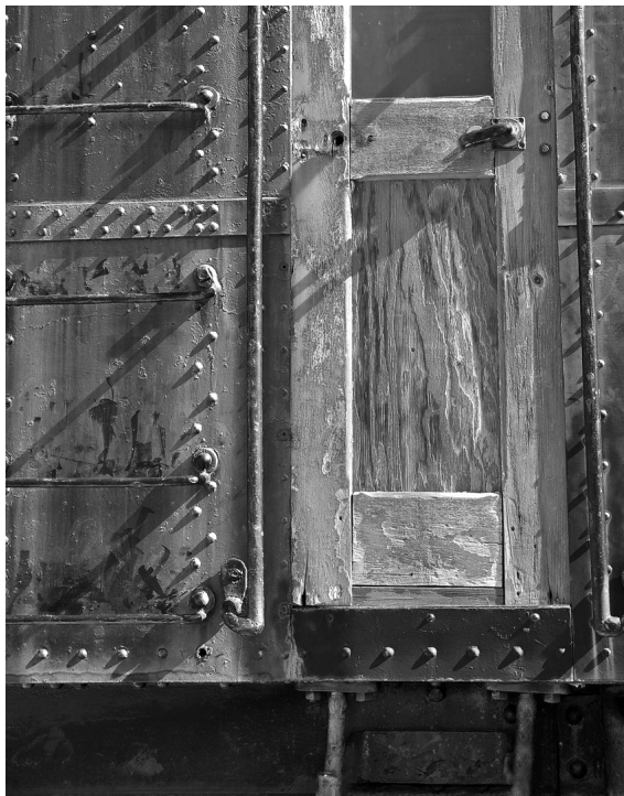
Monochrome Print 2nd place by Alan Forney