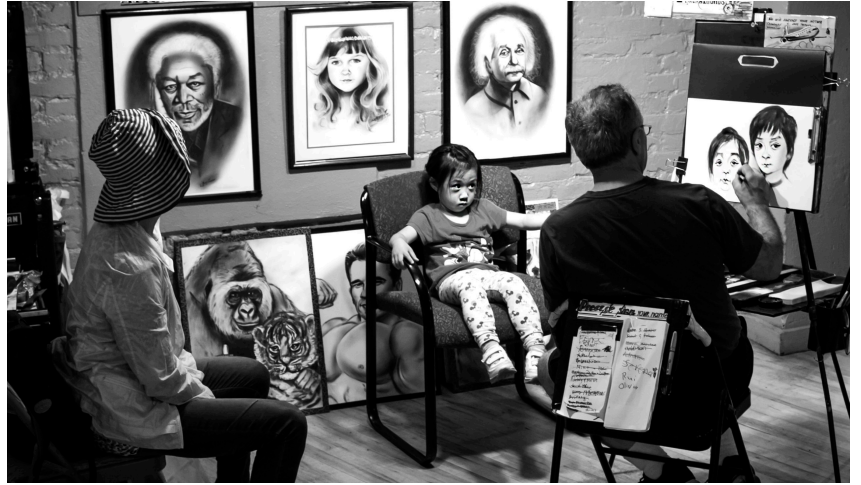
Monochrome Digital 1st Place by Matt Bevill