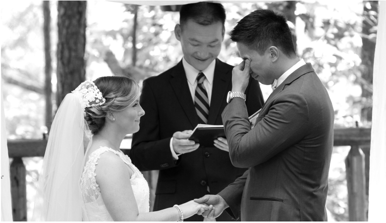
Monochrome Digital 2nd Place by Matt Bevill