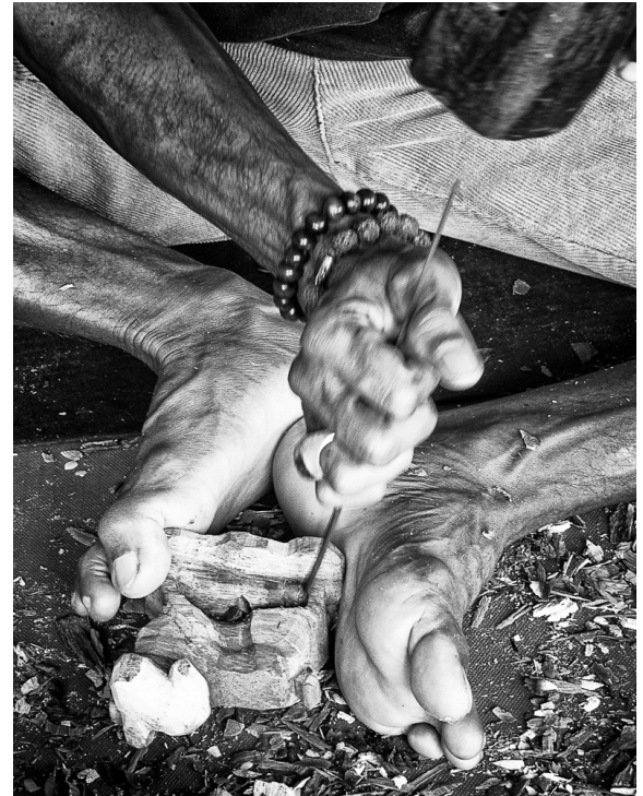
Monochrome Print 1st Place by Eddie Sewall