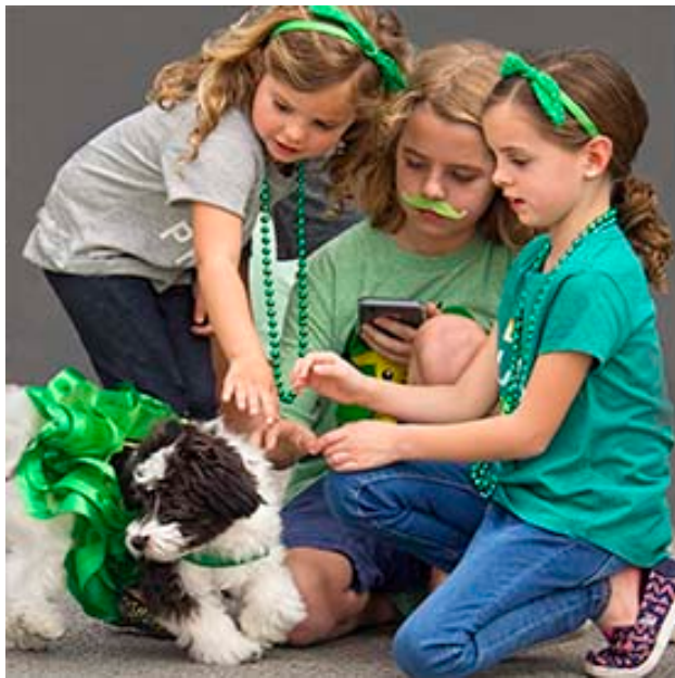
Color Print 3rd Place by Barb Staggs