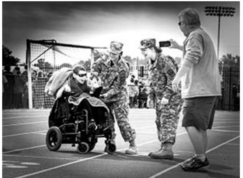
Monochrome Print 3rd Place by Barb Staggs