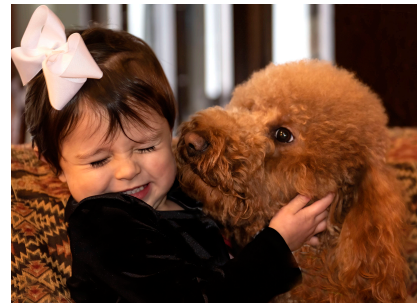
Interactions-2nd Place, Digital. See additional winners p. 6-9