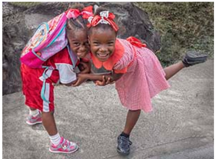
Color Print 2nd place by Barb Staggs