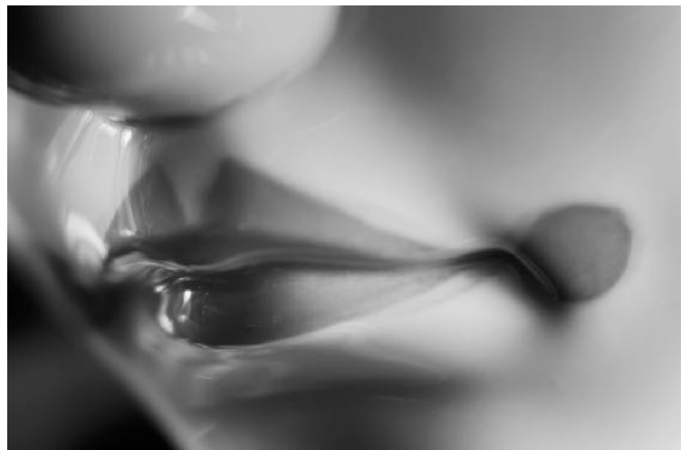
Monochrome Digital 1st Place by Eddie Sewall