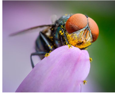
Macro/Close-up— 2nd Place, Digital. See additional winners p. 7-9