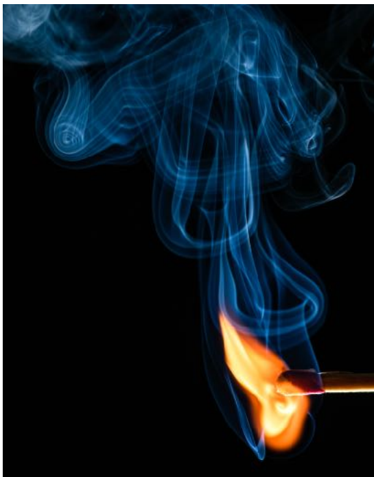
Color Print 3rd Place by Earl Todd