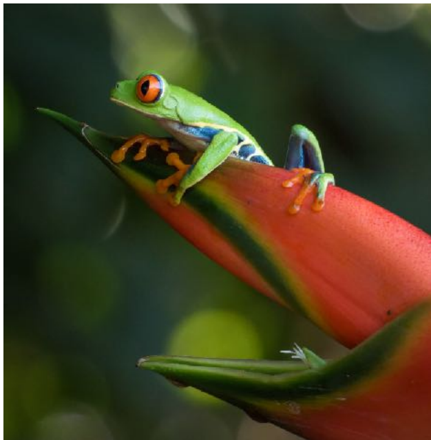
Color Digital 1st Place by Emily Saile