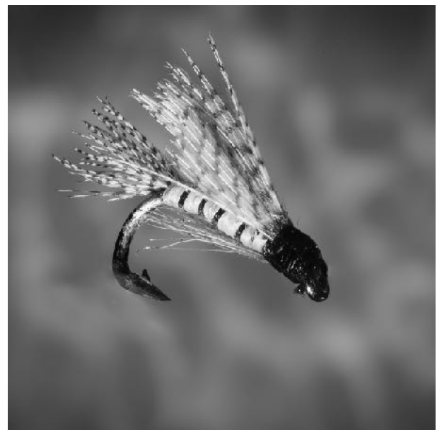
Monochrome Print 2nd Place by Earl Todd