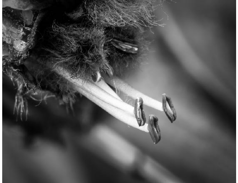
Monochrome Digital 3rd Place by Earl Todd