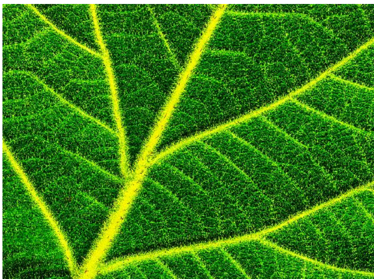
Color Digital 3rd Place by David Blue