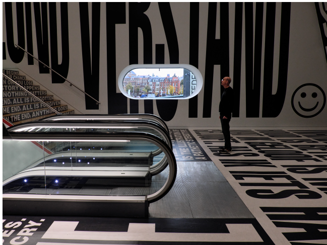
Color Digital 1st Place by Ernie High