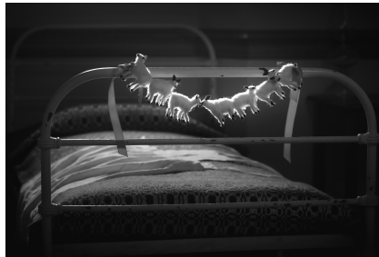
Open- 3rd Place, Mono Digital. See additional winners p. 5-6