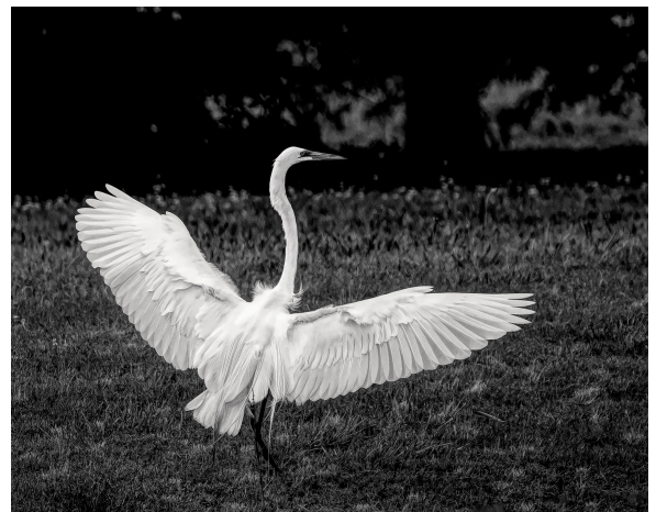
Monochrome Digital 2nd Place by Barb Montgomery