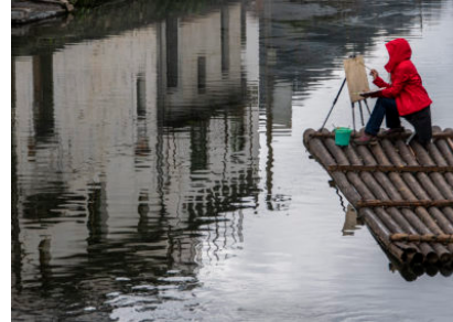
Contrasts- HM, Color Digital by CT Chi. See additional winners p. 5-6.