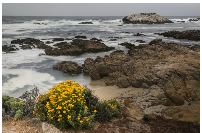
Color Digital 2nd place by Matt Bevill