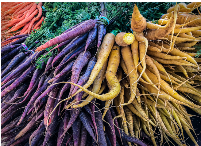
Color Digital 1st place by Barb Staggs