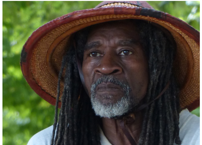
Color Digital 3rd place by Liz High