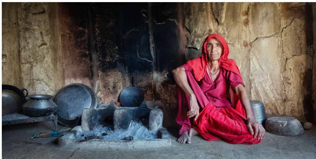
Color Digital 1st place by Gayle Biggs